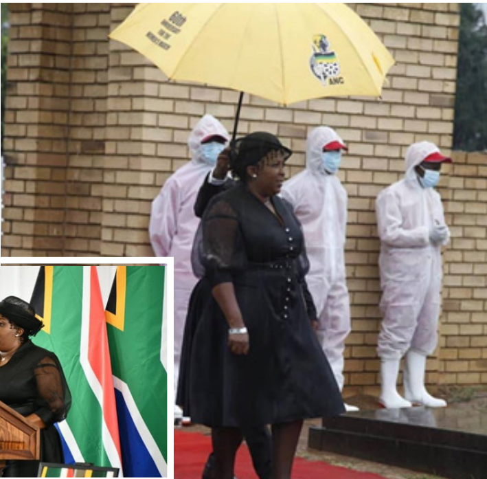
Mpumalanga Premier, Refilwe Mtsweni-Tsi-