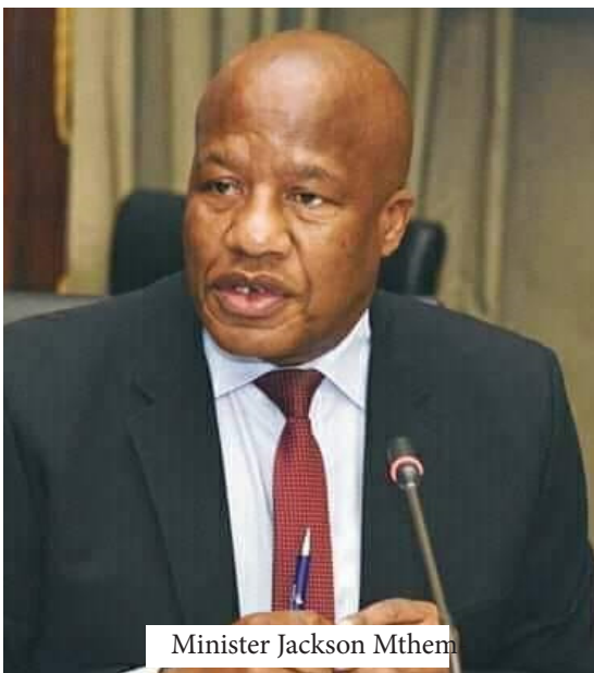
Minister Jackson Mthembu

He passed away on Thursday, 21 January 2021, following Covid-19 related complications and was laid to rest on Sunday the 24 of January 2021 as per national lockdown regulations.